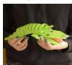
JULY 19th Crocodile Craft